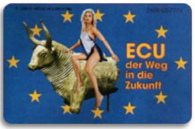
German phone card