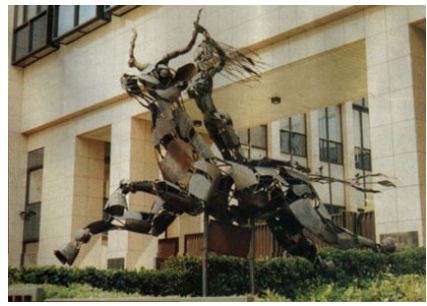
Sculpture outside the Council of Ministers in Brussels