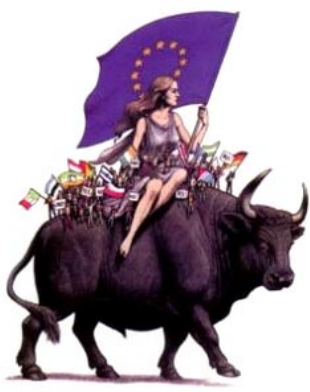
TIME Magazine's article on United Europe