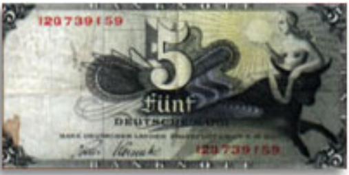
1948 German mark note