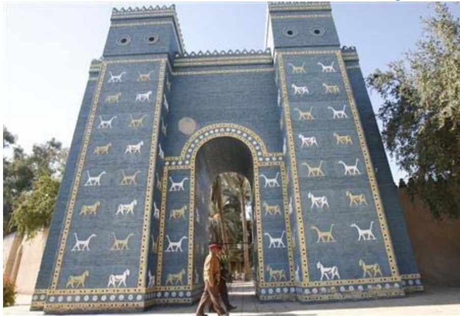
Iraqi soldiers walk past a replica of the Ishtar Gate of Ancient Babylon, south of Baghdad, January 13, 2009.

Largely overlooked by the Western news media over the past few weeks was an enormously significant story. The government of Iraq is moving forward with plans to protect the archaeological remains of the ancient City of Babylon, in preparation for building a modern city of Babylon. The project, originally started by the late Saddam Hussein, is aimed eventually at attracting scores of "cultural tourists" from all over the world to see the glories of Mesopotamia's most famous city. What's more, the Obama Administration is contributing $700,000 towards "The Future of Babylon Project," through the State Department's budget.