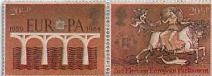
Euro coins and stamps